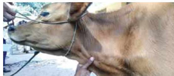
Fig.1. Jugular vein engorgement with positive venous stasis

Haematobiochemical examination revealed leukocytosis (13,000/ \mu L) and elevated AST (85IU/L). Echocardiography revealed the presence of anechoic fluid surrounding the heart with echogenic fibrin in between the pericardial layers suggestive of pericarditis (Fig. 2).