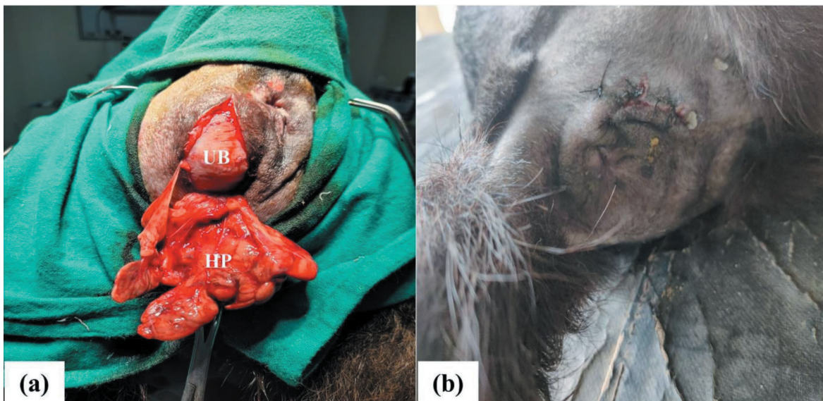
Fig 2: (a) The hernial contents were identified as enlarged or hyperplastic prostate (HP) along with urinary bladder (UB). (b) The skin and subcutis were apposed in a routine manner.

rate of 20 mg/kg body weight for seven days IV and meloxicam at the rate of 0.2 mg/kg body weight for five days was given intravenously. Low dose finasteride at the rate of 0.1 mg/kg was given orally for one