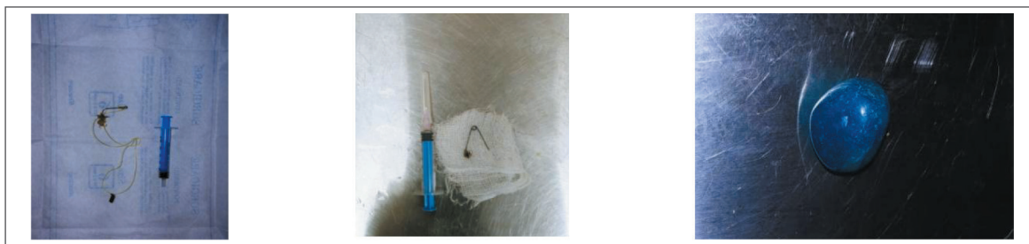
Figure 04 Recovered foreign bodies

pica. Pica is usually associated with several deficiencies, especially in case of puppies. This deficiency symptom later develop in to a behavioural disorder, in which the dogs keep on ingesting innate objects even though they might not have an apparent deficiency. The vomiting observed in all the cases may be due to the gastric irritation caused by the foreign body. The increased rectal temperature, congested mucous membrane and increased total WBC count may be attributed to the onset of infection and toxemia. Patient A, which had ingested the aquarium pebble showed a reduced hemoglobin and RBC count because of four days of complete anorexia and its absence of defecation may be due to the complete obstruction of GI tract. Plain radiography is the suitable method for diagnosis of metallic foreign body (Uma Rani et al. 2010). Symptomology of intestinal obstruction is usually nonspecific which include vomitions (which do not respond to antiemetic), anorexia, dehydration and loss of condition (Capak et al. 2001). Along with the clinical signs, abdominal palpation helps in making a presumptive diagnosis in gut obstruction (Peppler et al. 2008).