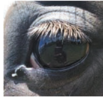
Fig. 8. Case 3: Complete corneal clarity after one month

The eyelids were retracted using ocular speculum to increase the visibility of the surgical site. By using a sterile keratome a small nick incision was made in the cornea at the level of 1 – 2 o' clock position (Fig. 3) and with the help of a sterile 18G needle aspirated the worm through the nick incision (Fig. 4). For one case, the corneal incision was made using 11 B.P. blade and the worm was flushed out from the anterior chamber. Corneal incision was kept open for postoperative days in three out of four cases and in the case which required a larger incision using the blade, the corneal incision was sutured using polyglactin 910 size 6/0.