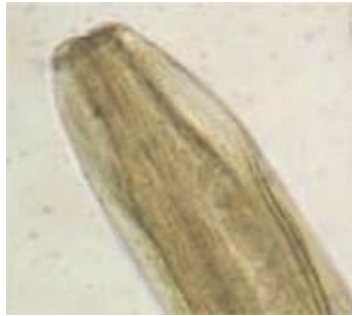
Fig. 5. Setaria equina - head end of immature female has a peri buccal ring with two crescentic prominences