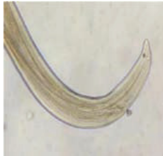
Fig. 6. Setaria equina - immature female – tail end ends in a small knob which is smooth

mg/kg body weight intravenously. Animal was restrained in lateral recumbency with affected eye positioned upwards. Prepared the affected eye aseptically with povidone iodine collyrium (1:50). Auriculo-palpebral nerve block was given to prevent the eyelid movements.