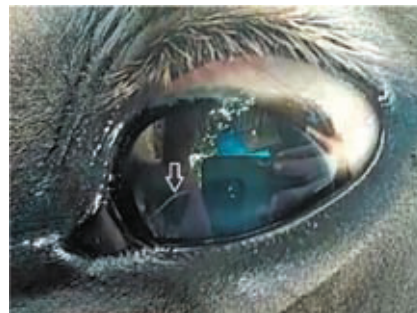
Fig. 2. Case 3: A white thread-like worm seen in the eye (arrow)