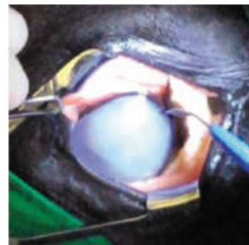
Fig. 3. Stab incision of cornea using keratome

water withheld for six hours). The animals were premedicated with inj. xylazine at the rate of 1.1 mg/kg body weight and inj. diazepam at the rate of 0.2 mg/kg body weight intravenously. Induction of anaesthesia was done with inj. ketamine at the rate of 2.2