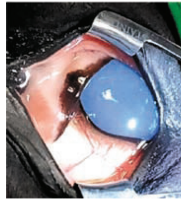
Fig. 1. Blue eye

All the animals were pre-operatively fasted (food withheld for twelve hours and