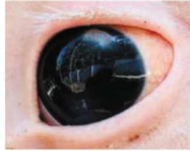
Fig. 7. Case 2: Complete corneal clarity after three months

mg/kg body weight intravenously. Animal was restrained in lateral recumbency with affected eye positioned upwards. Prepared the affected eye aseptically with povidone iodine collyrium (1:50). Auriculo-palpebral nerve block was given to prevent the eyelid movements.