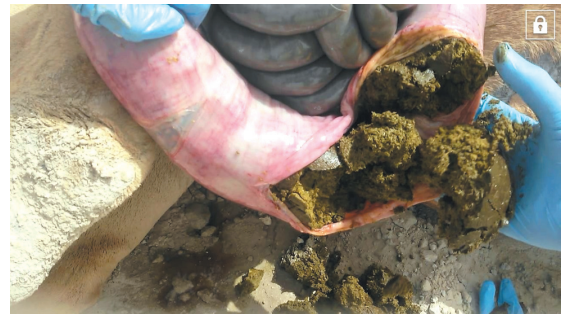
Fig. 4. Hard mass removed from the impacted loops.