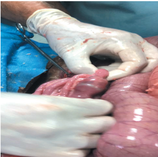
Fig. 2. Palpable hard mass lodged in the spiral colon.

distention and absence of fecal output in camelids indicated either mechanical or functional intestinal obstruction (Sullivan et al. , 2005). In camels, ingestion of fibrous shrubs and licking of hairs due to nutritional deficiency led to the formation of trichobezoars and phytobezoars respectively in the intestinal tract (Eljalii et al. , 2014). Intestinal obstruction may