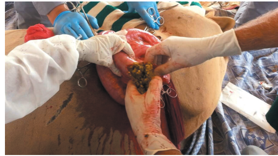
Fig. 3. Dry food was removed from the impacted loops.

distention and absence of fecal output in camelids indicated either mechanical or functional intestinal obstruction (Sullivan et al. , 2005). In camels, ingestion of fibrous shrubs and licking of hairs due to nutritional deficiency led to the formation of trichobezoars and phytobezoars respectively in the intestinal tract (Eljalii et al. , 2014). Intestinal obstruction may