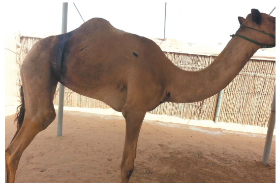
Fig. 5. The camel after one month of surgery.

occur when one of the zootrichobezoar or phytotrichobezoar finds its way into the intestine leading to an obstruction. In camelids, ingested foreign material was reported to form bezoars within the first gastric compartment and caused obstruction of critical size at the narrowest portion of