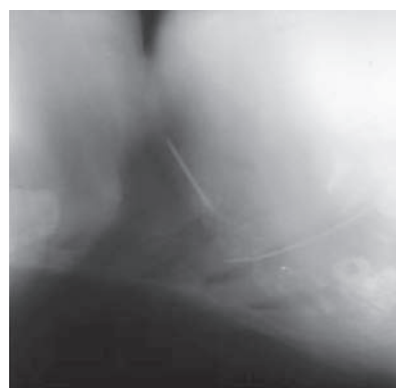
Fig. 2: Reticular wall evident as crescent shaped does not contract away from transducer in cases of reticulo-phrenic adhesions