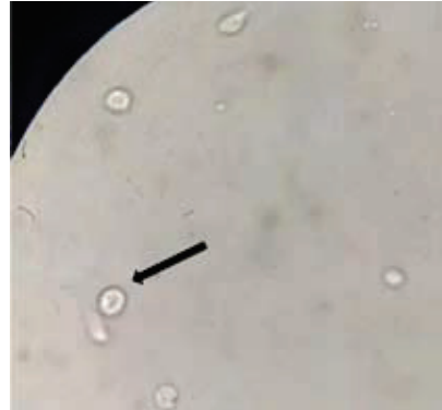
Fig. 3. Trichomonads on wet mount preparation appeared as single, rapidly moving, translucent small flagellates on light microscopy (40x)