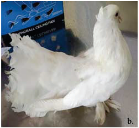
Fig. 1. a. Australian white pigeon presented with open mouth breathing, watery eyes and difficulty in maintaining balance

After proper restraining of the bird, physical examination revealed whitish spots on the left eye. Oral cavity examination revealed the presence of white flakes on the upper beak with foul odour (Fig. 2). Throat swabs were collected from the lesions using sterile moistened swab and checked for motile trophozoites within 30 minutes under a light microscope at 10x and 40x magnifications. Under light microscopy of freshly processed samples,